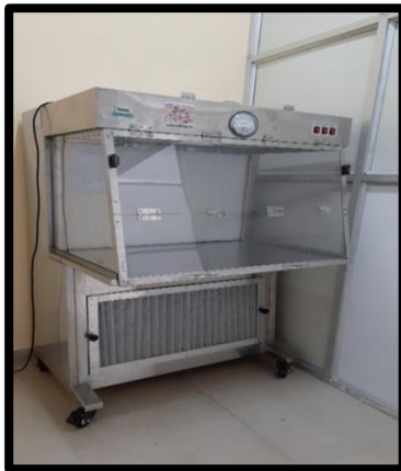
Laminar Flow Cabinet