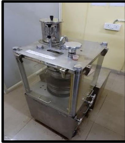
Tablet Punching Machine