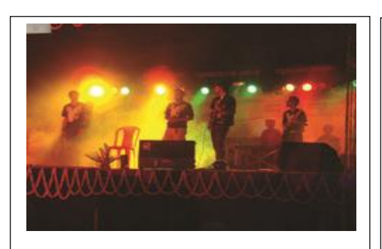
Student Annual Programme