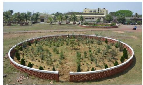
1st Year Boys' Hostel, Work Shop (Girls' Hostel & Sr. Boys' Hostel are