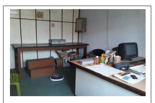
Medical Unit with Bed